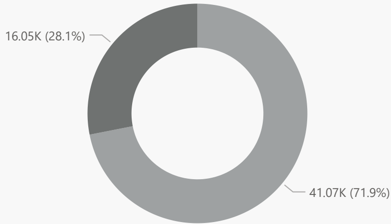
Percentage of Customers by Gender